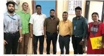
Members of the committee of the college that will execute the project